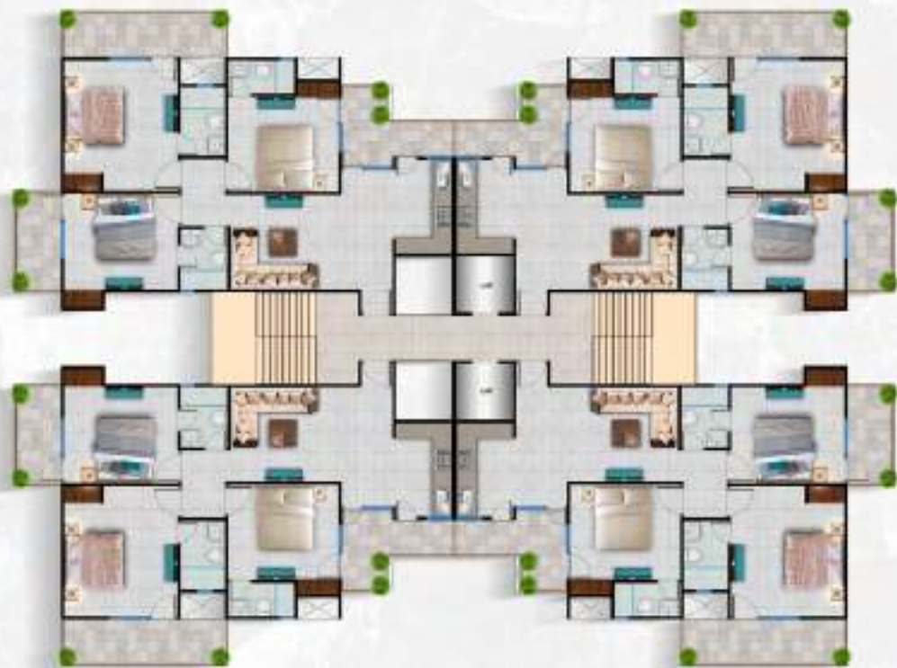
TOWER A & B